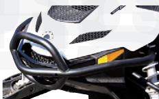
HEAVY DUTY FRONT BUMPER 860200542