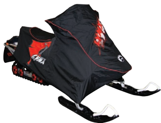
COVER For 1+1 seat. 619500010